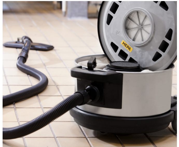
For minor dry spills, use a vacuum cleaner with HEPA filter to remove the bulk of the product and finish up with a soft stream of water from a hose.