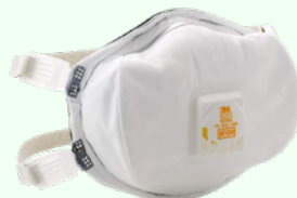
N100/P100 or P3 filtering facepiece respirator