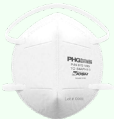
N95 or P2 filtering facepiece respirator