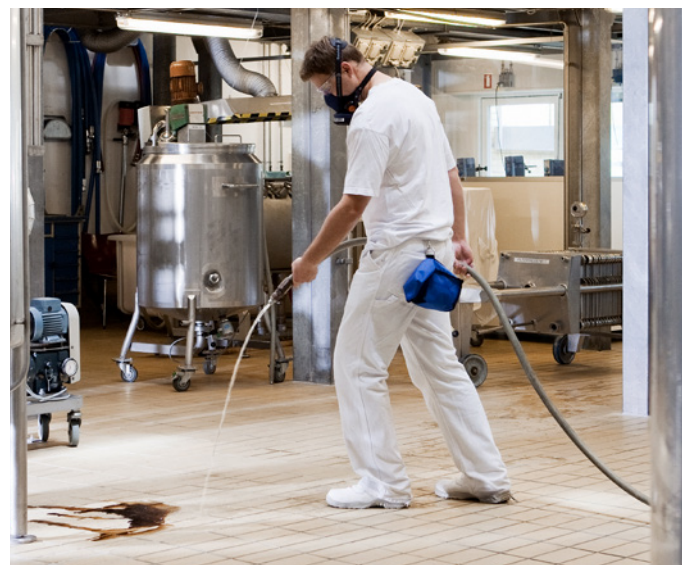
For minor wet spills, use a soft stream from a water hose (not jets or high pressure). Discharge of water containing microbial products should be performed according to local legislation, where such exists.