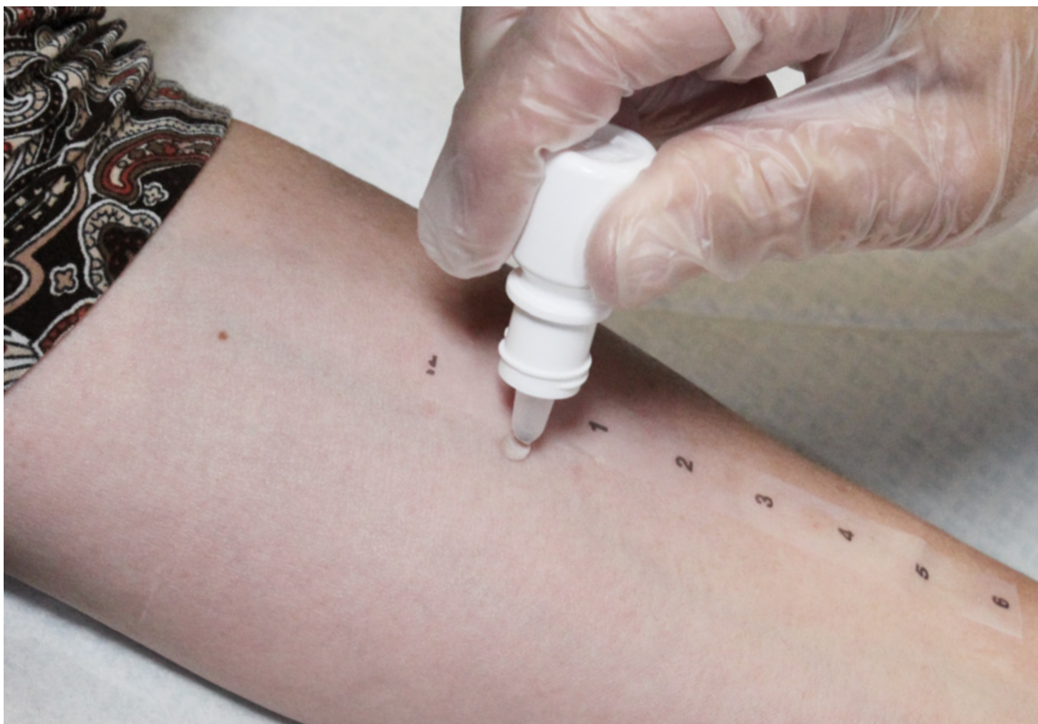
A skin test may detect antibodies even if the person has no symptoms of allergy. If precautions are not taken to reduce exposure, allergic symptoms may develop later on.

When a person becomes sensitized or allergic to an enzyme, the body has produced antibodies against the enzyme. A simple skin test can show the presence of antibodies and thereby confirm if the person is allergic or is developing an allergy. Alternatively, a blood test can be used to quantify the number of antibodies produced against a specific enzyme.