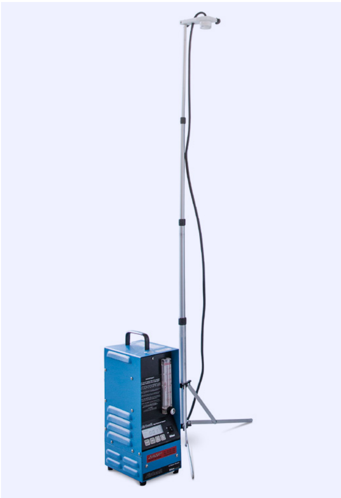
Portable medium volume pump Used for point monitoring