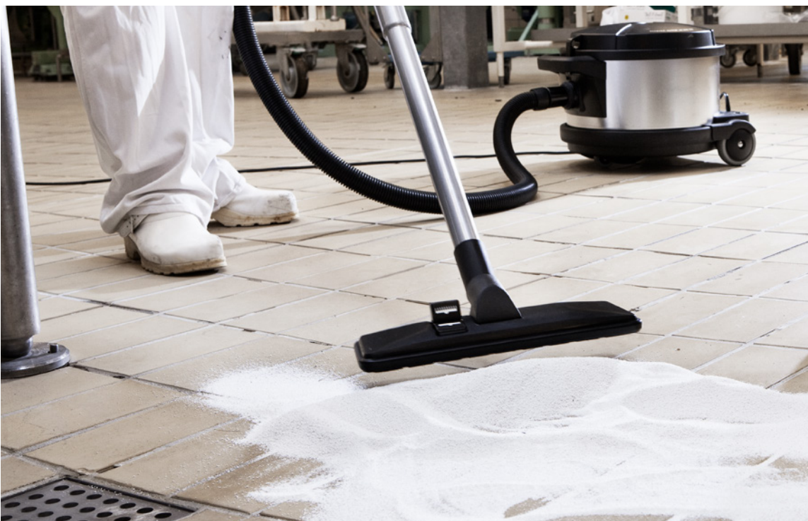
Use vacuum cleaners equipped with an appropriate HEPA filter to remove spills of granulated enzymes.

Be careful not to expose others e.g. when enzyme containers are disposed of or packaging material compressed.