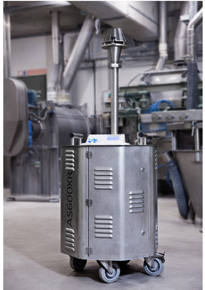
Stationary high volume pump Used for measurement of area exposure